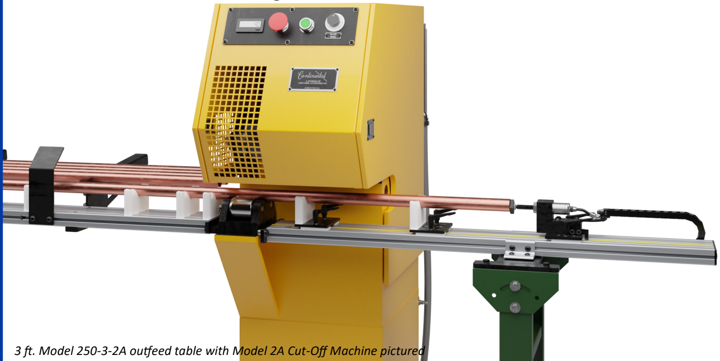
3 ft. Model 250-3-2A outfeed table with Model 2A Cut-Off Machine pictured

The Series 250 outfeed tables are also available with an optional Digital Readout (DRO) upgrade. This option adds a battery-powered digital display to the length gauge, making setting cut lengths easier, faster, and more accurate.